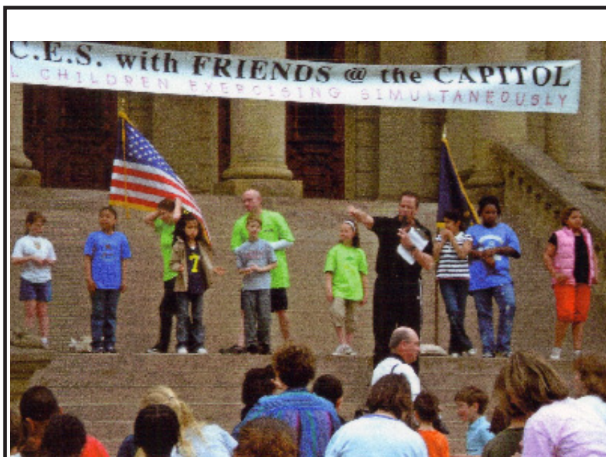
Cumberland staff and students at ACES Day at the Capitol building in Lansing.

In addition to the regular K-5 instructional program, Cumberland provides special education classes for visually impaired and autistic youngsters.