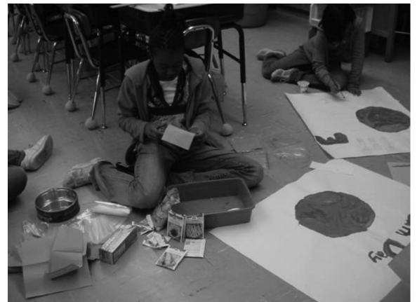
Cumberland ES Students Planting seeds on Earth Day 2009