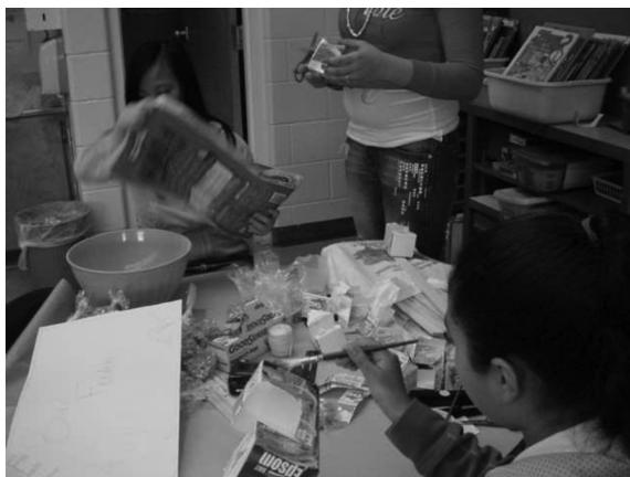
Cumberland ES Students Making bird feeders out of recycled milk cartons Earth Day 2009